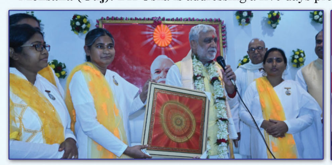
Minister of India is being presented a frame of God Shiva by BK sisters.