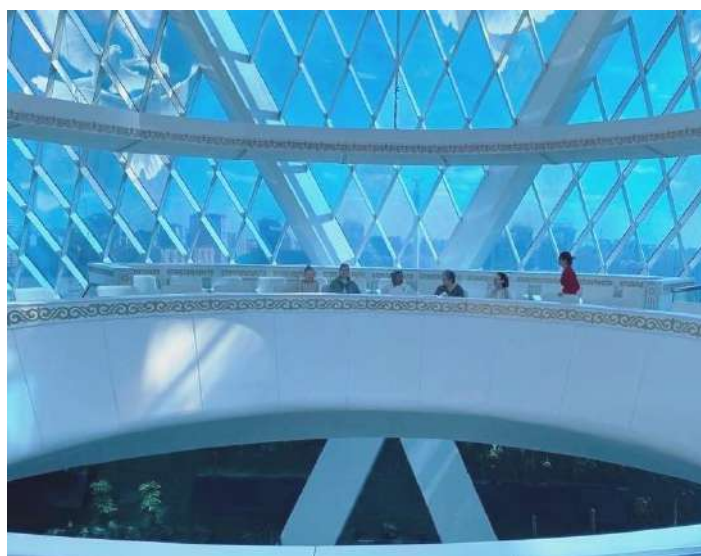
The Pyramid – Palace of Peace