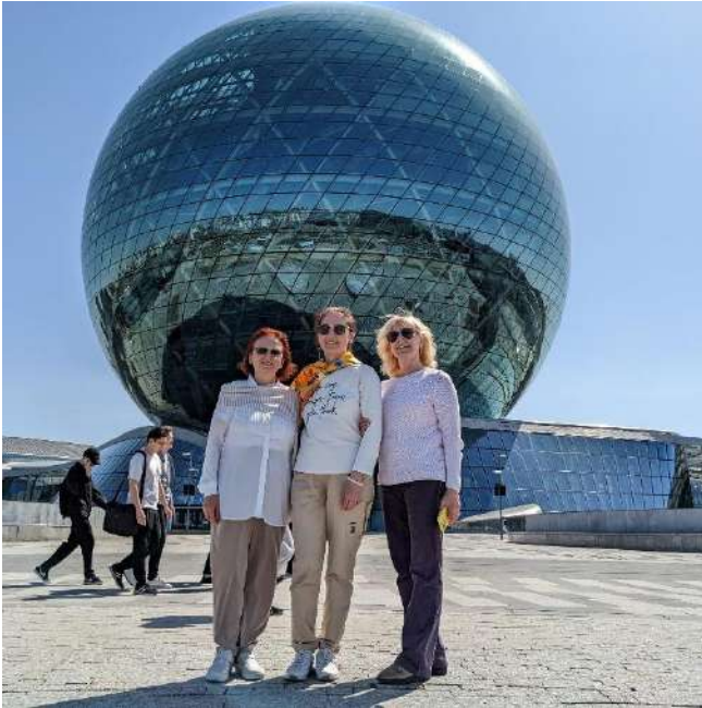
Expo-Astana Congress Centre