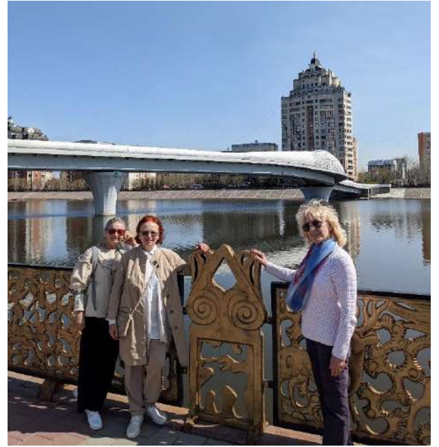
Embankment of the Ishim River