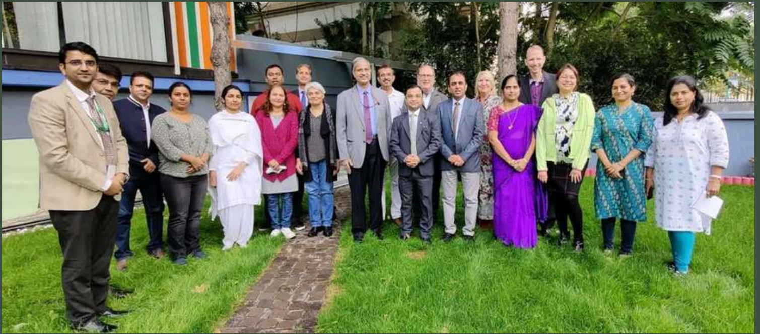
Group Photo with Invitees