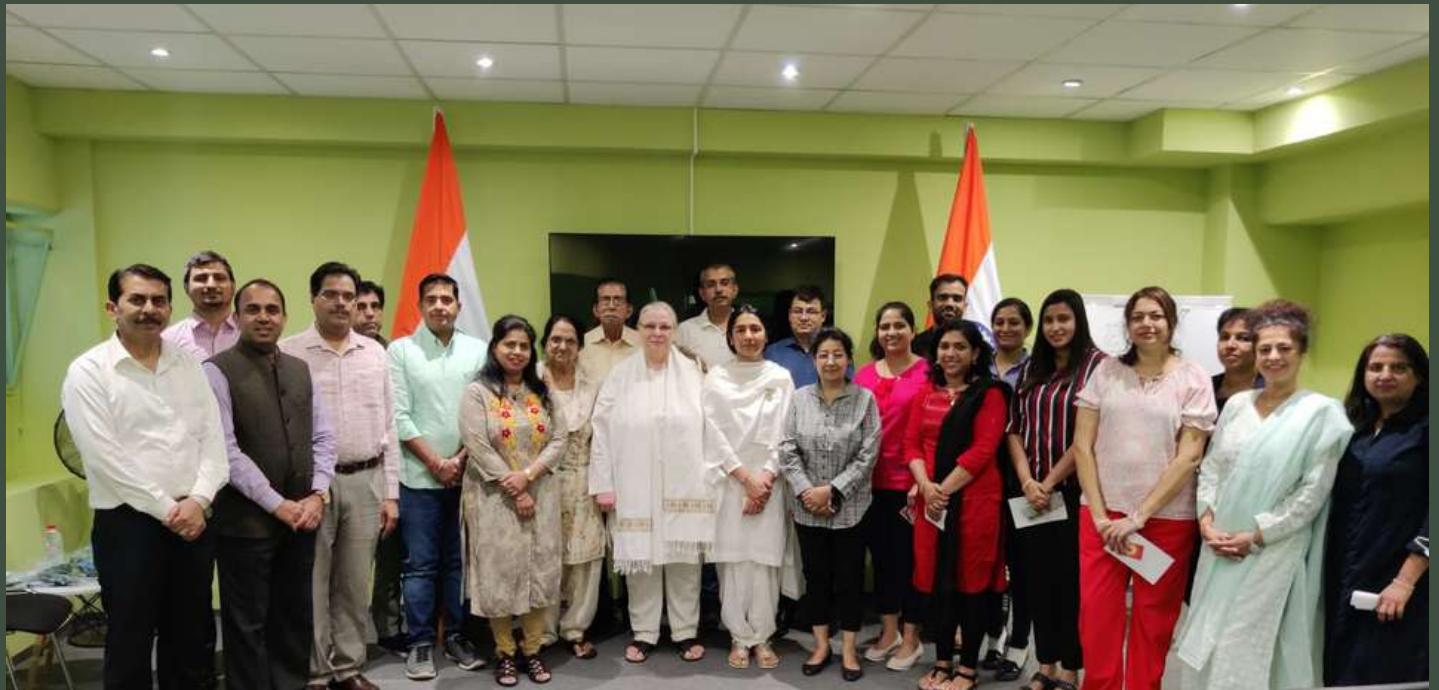
Group Photo with Participants