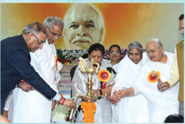
Raipur: All India Conference for Administrators is being inaugurated by Mr. Bhupesh Baghel, Chief Minister, HE Anusuiya Uikey, Hon'ble Governor, Justice Gautam Chordia, Judge of CG High Court, BK Asha and BK Kamla.