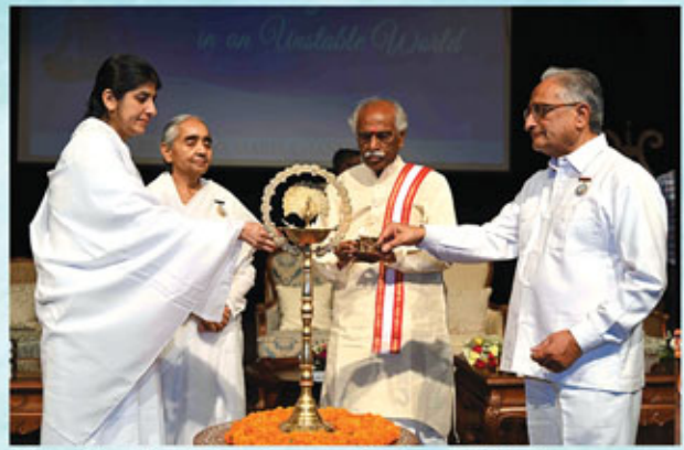
Chandigarh: A Seminar on 'Being Stable in an Unstable World' is being inaugurated by HE Bandaru Dattatreya, Hon'ble Governor of Haryana along with BK Shivani, BK Uttra and BK Mahender.