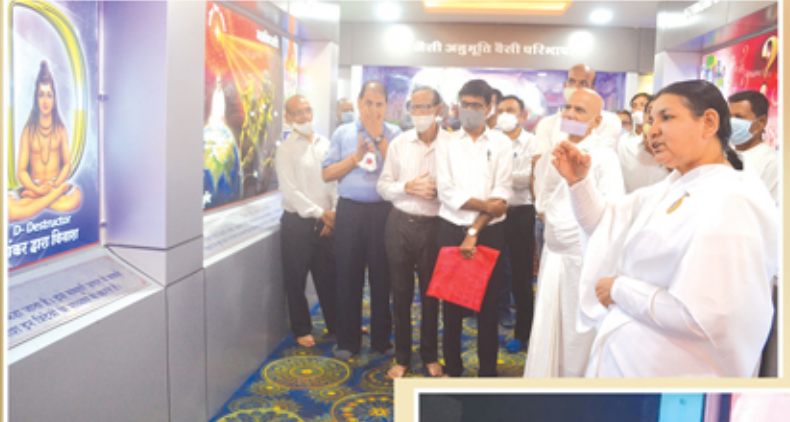
INDORE (Om Shanti Bhawan): Jain Saint Kamal Muni is being explained Spiritual Art Gallery by BK Anita.

RNI No.19818/1970, Postal Regd. No.RJ/SRO/9560/2021-2023 Posting at Shantivan-307510 (Abu Road) Licensed to post without prepayment No. RJ/WR/WPP/001/2021-2023. Published on 7th of each Month & Posted on 9th to 10th of each month. Price 1 copy Rs. 8.50, Issue : December, 2021.