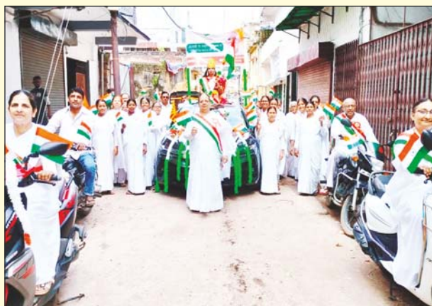
Ranchi: 'Har Ghar Tiranga' rally is being taken out in the streets of the city by Brahma Kumaris.