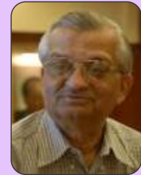
Anil Kakodkar Nuclear Scientist Chairman, Solar Energy Corp. of India

"It is a matter of balance. I am reminded of the snake who was told by the sadhu to hiss but not terrorise the people."