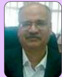
Chandrashekhar Oak Collector & District Magistrate Mumbai City