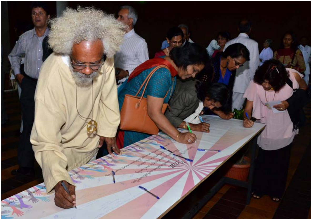
Signature of pledge by the public.