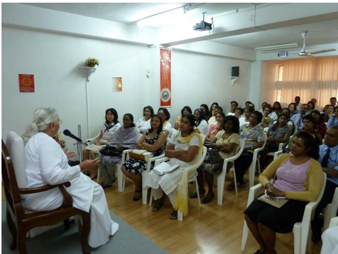
Addressing students at Inner Space, in the Capital city.