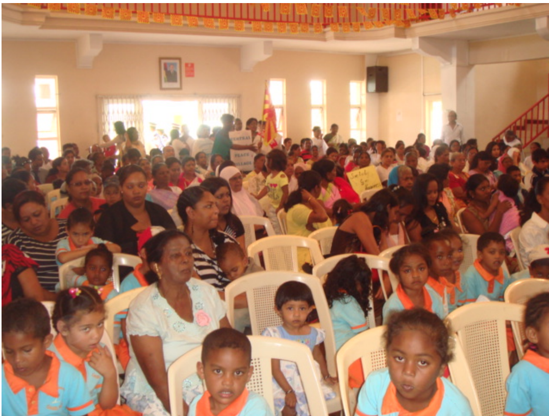
View of the audience.