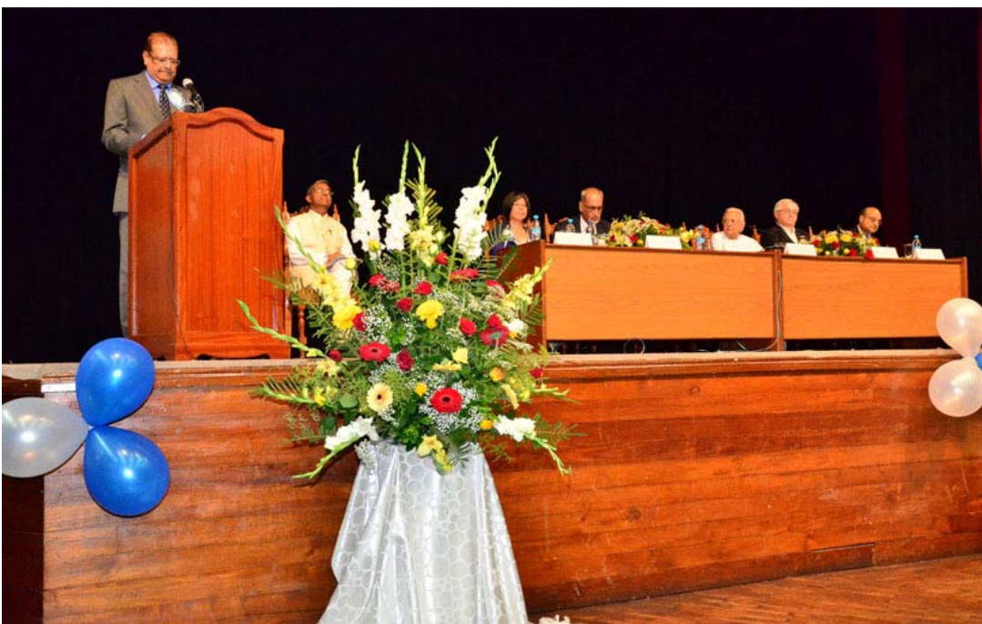
President of Republic of Mauritius addressing audience