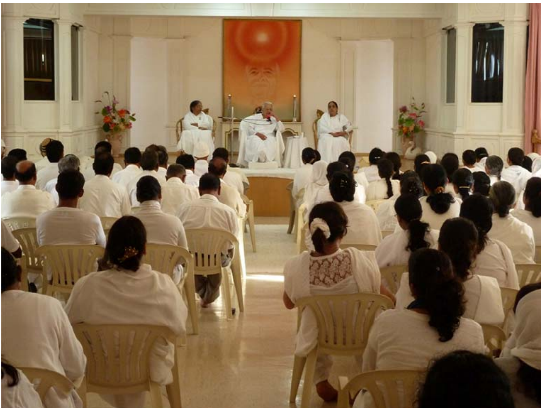
Addressing Brahmins at one of the centre.