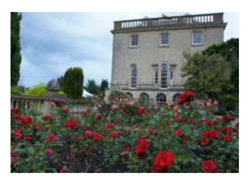
This year, the Festival hosted 5 meditation pavilions, providing experiences opportunities to learn about meditation on several aspects: Hope, God, Peace, Learn to Meditate, Love.