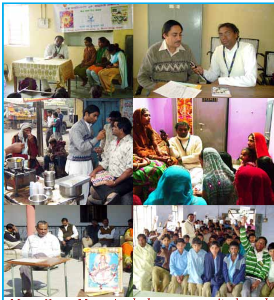
Mera Gaon Mera Anchal, a community based program on Radio Madhuban