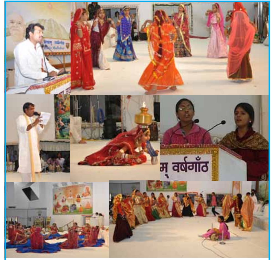
Locals celebrating the 1st Anniversary of Radio Madhuban