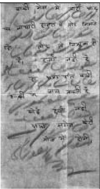
One of the many letters of BaapDada written to the author of this article.