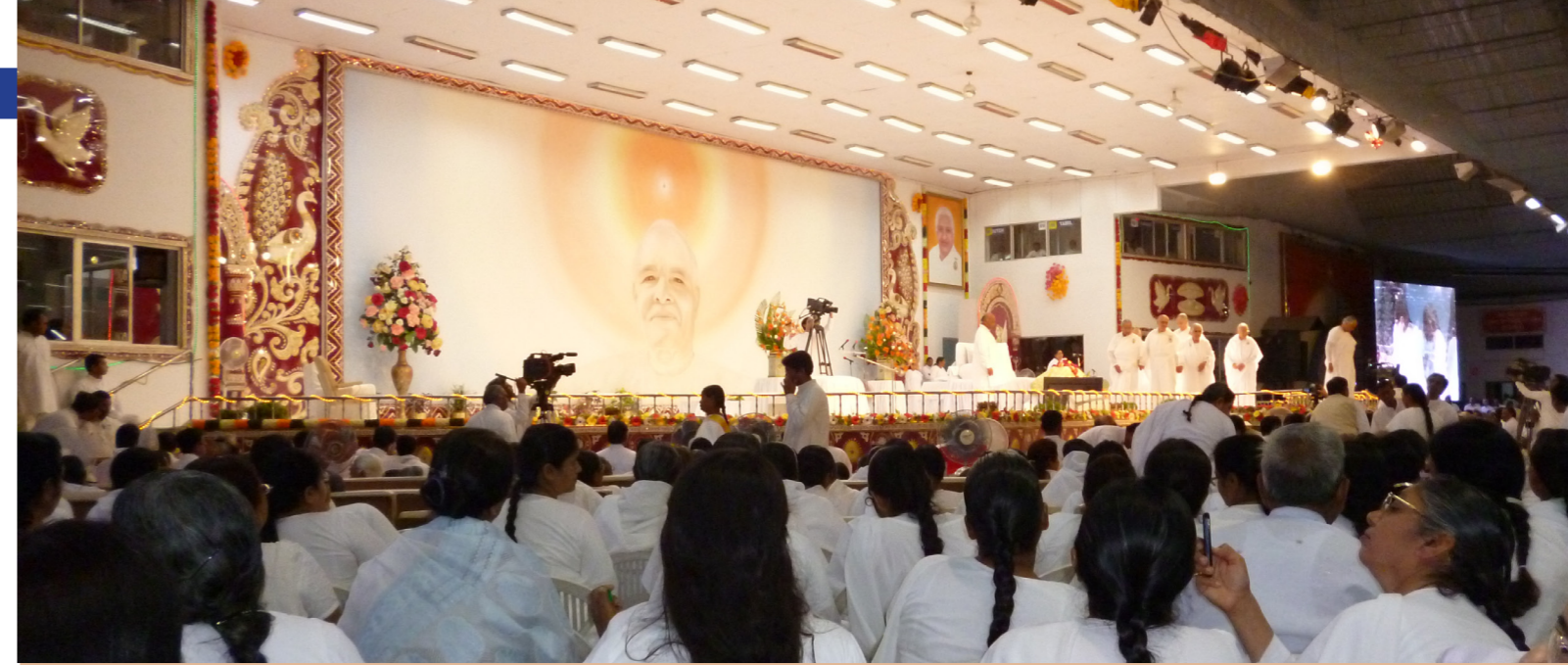
The Dadis on stage before the last meeting of 2010/2011 season

They don't understand that their condition has become like that because of the influence of bad company and that they have many strong vices. Why do you say that you fell because you experienced storms of Maya? It all depends on you!