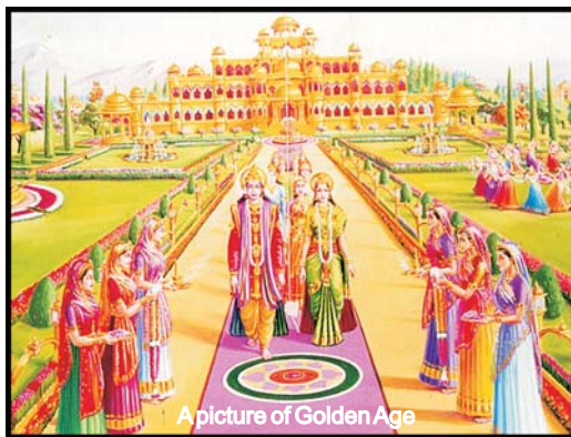
A picture of Golden Age